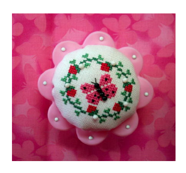
Stitch Count: 29 x 27