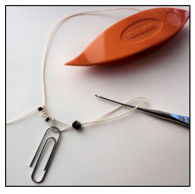
SCMR 2, bp, 2 - 2, bp, 2.

Slip the 4mm bead over the starting loop (a paper clip is helpful as a space saver between the start of the tatting and the bead). Then, put the shuttle through the loop. Tighten the loop up snug to the bead by pulling on the shuttle thread. (You have tatted halfway around the bead at this point.)