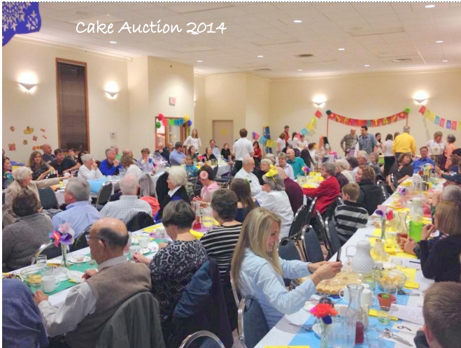
Cake Auction 2014