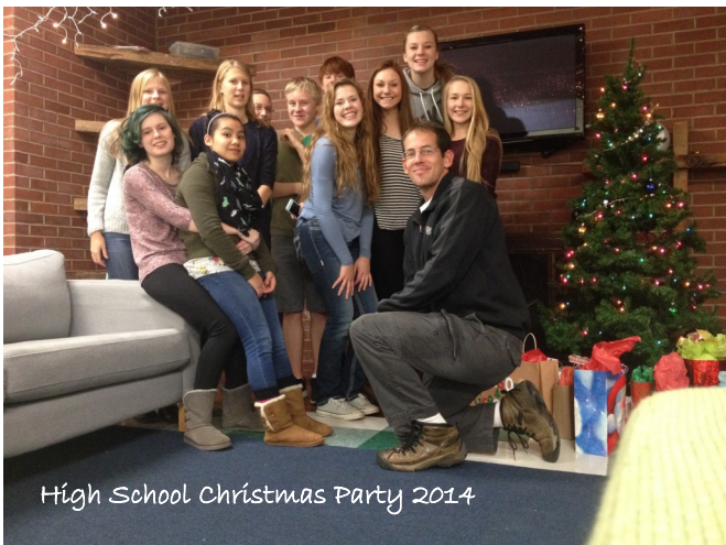
High School Christmas Party 2014