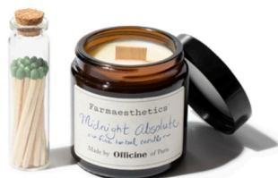
Farmaesthetics Midnight Absolute Candle $38

Most impressively though, Chappert studied centuries-old literature to discover what wax ancient herbalists utilized, all in the hope of uncovering a more eco-conscious option. These recipes delivered, in the form of French rapeseed wax — which employs the bright yellow flowers of the same name that Provence farmers used to cleanse their soil from the previous crop. When used as a wax, the rapeseed burns much slower than a traditional soy base, but also cleans the air. The beeswax in the formula is sustainably sourced, too, through a French beekeeper organization that ensures all honey and beeswax are obtained responsibly and safely. Each candle is hand-poured into amber apothecary glass jars with a beechwood wick that quietly crackles when lit, creating an experience for all your senses.