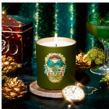
Otherland Adored Collection $36

vintage lipstick scents, violet, and Amarena Cherry. Why not grab the whole set and let your friends and family pick their favorites? Or keep them all for yourself, no judgment here.