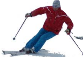
Point 2 Apex - turn pressure, edge angles increasing.