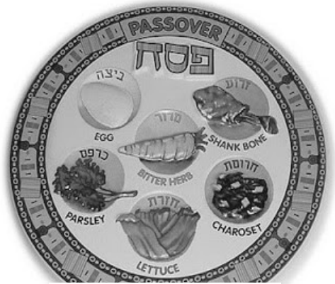
Traditional Seder plate