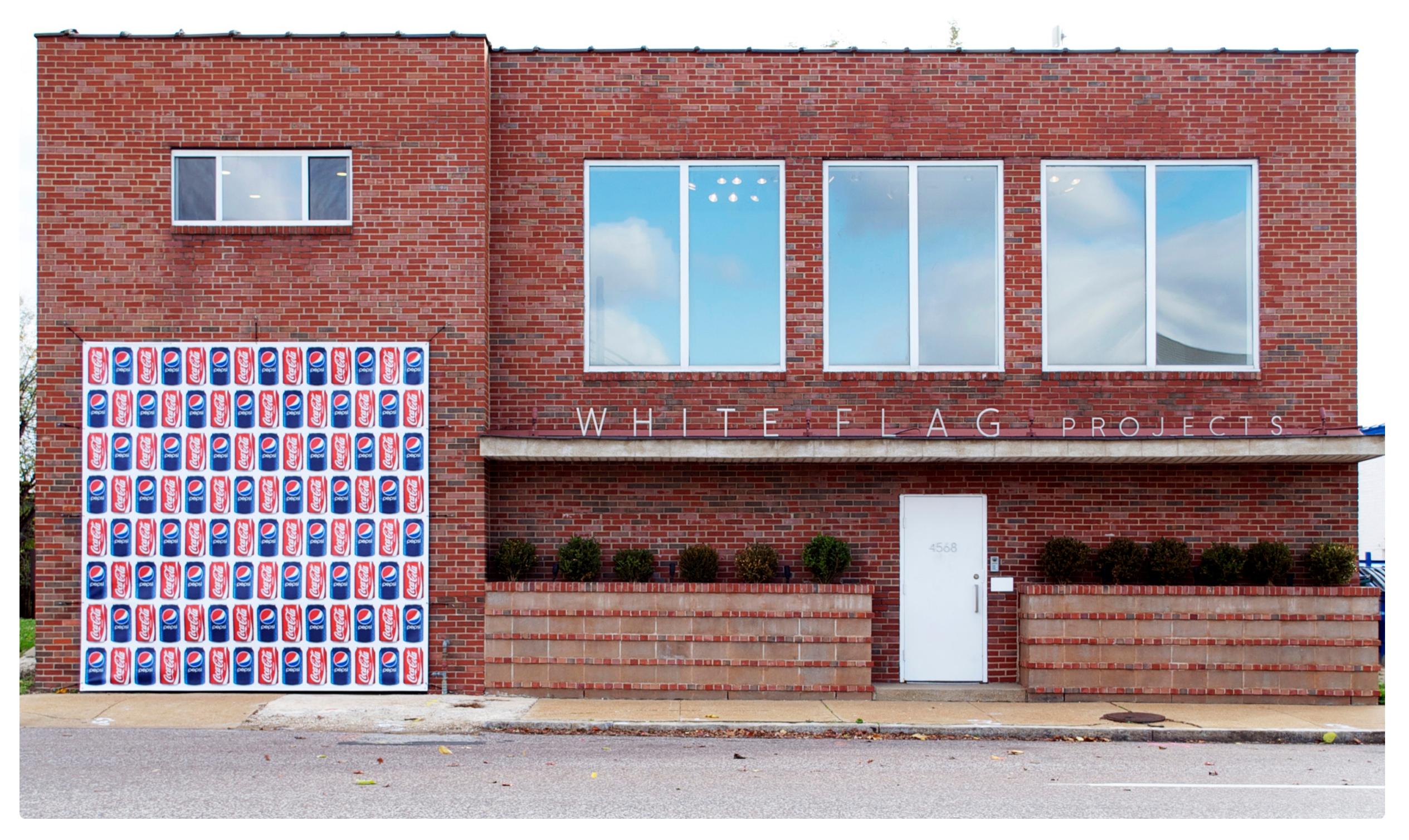
Jonathan Horowitz *Coke/Pepsi (112 Cans)*, 2011 UV ink on vinyl, 154 x 154 inches