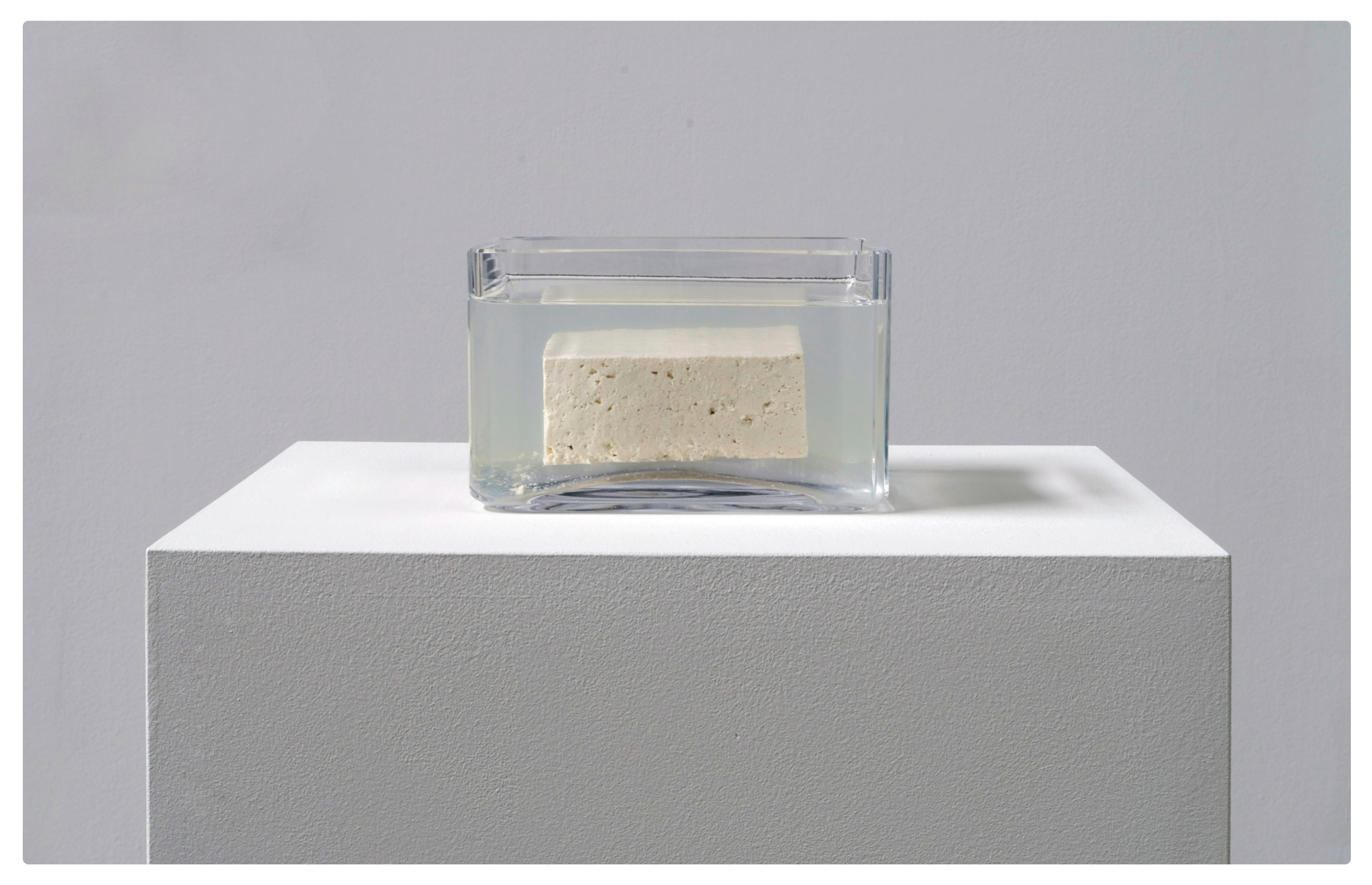
Jonathan Horowitz Tofu on Pedestal in Gallery, 2002 Tofu, water, glass dish, pedestal, 46 x 15 x 16 inches