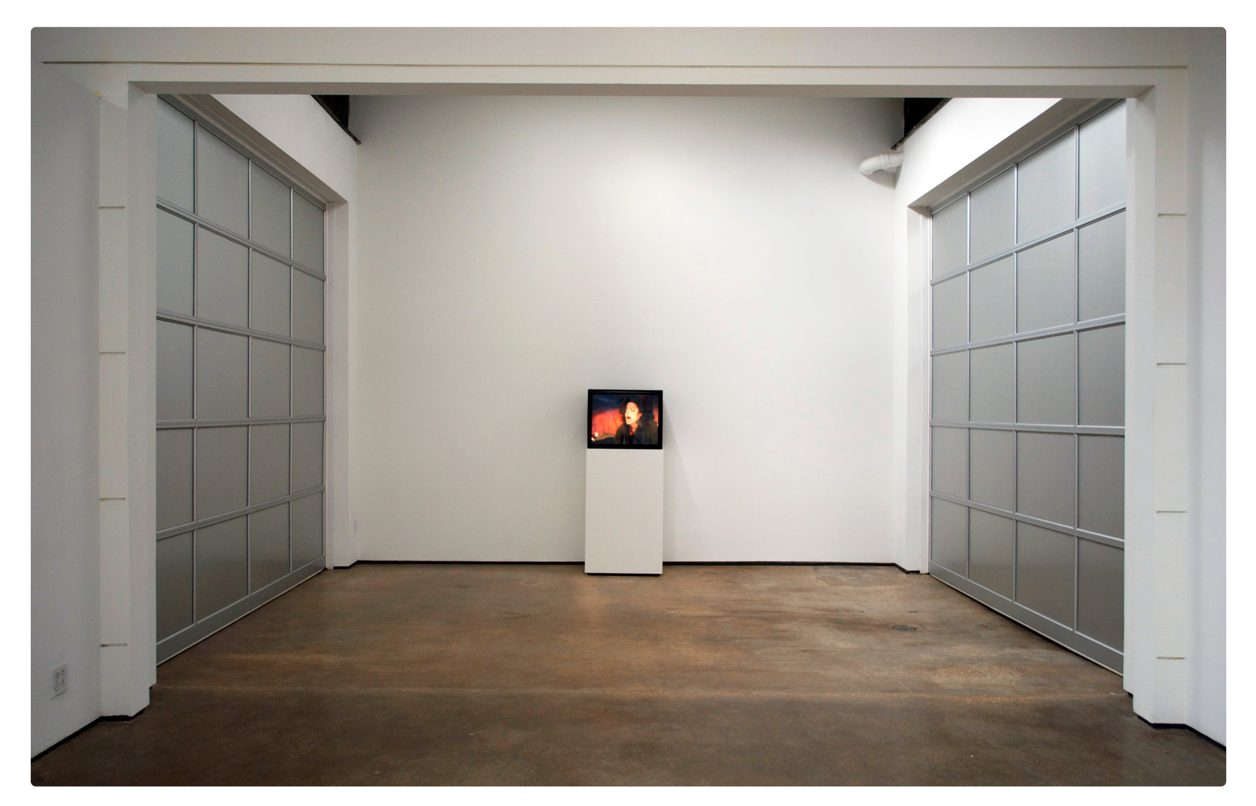
Jonathan Horowitz The Body Song , 1997 Single-channel video for monitor and projection