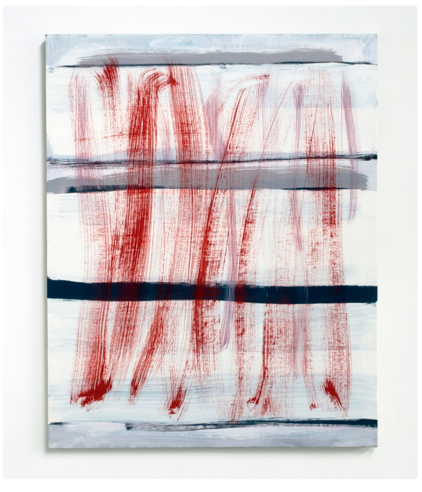
Jon Pestoni Red Sweep, 2009 Oil on canvas, 50 x 40 inches