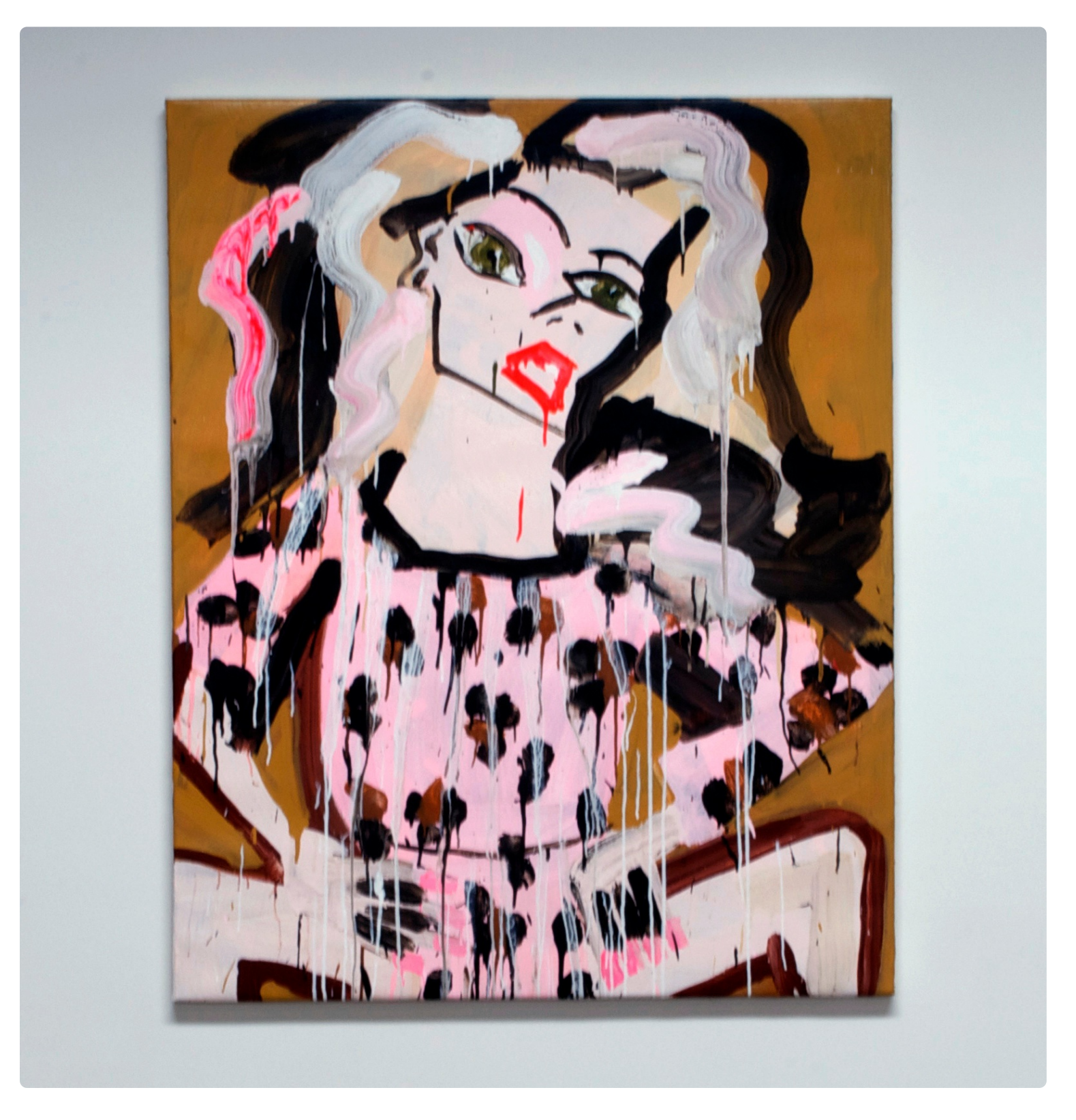
Katherine Bernhardt Untitled, 2011 Acrylic on canvas, 60 x 48 inches