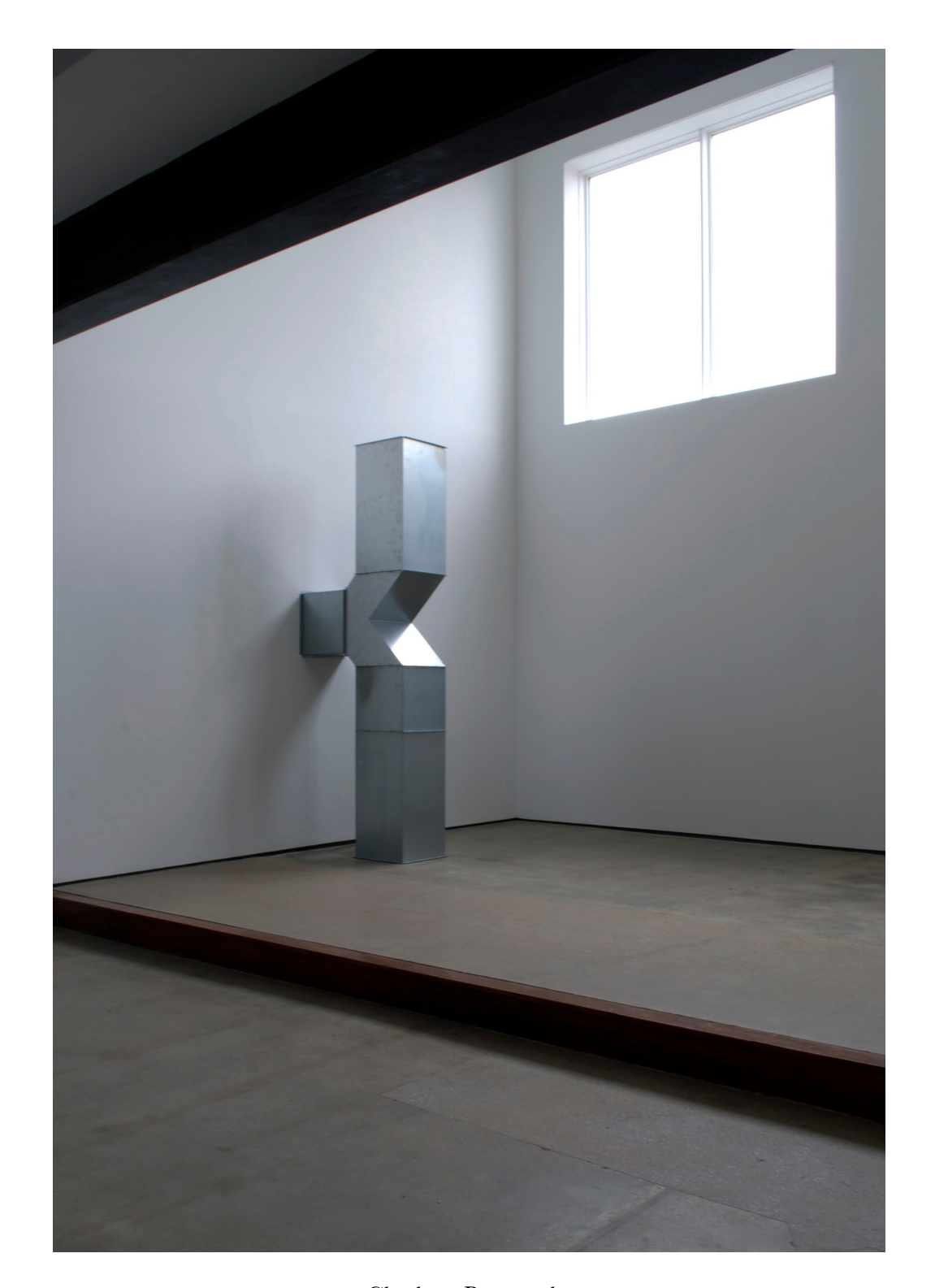
Charlotte Posenenske Vierkantrohre (Square Tubes) (Series D), 1967 Sheet steel, folded stereometric hollow volumes, dimensions variable

Beginning with mid-Century artists Charlotte Posenenske and Lee Lozano, who both willfully resigned from the art world at the very moment that they were hailed as being at the vanguard of their respective movements, "Day of the Locust" drafts a brief contemporary narrative of the endorsement and critique of radical ideological investment. From the promise of major art-formalist strategies as historic and qualitative gatekeepers, to the hope invested in artists to be uncommodifiable visionaries and agents of social change, the exhibit questions a culture that propagandizes certain idealistic myths as fervently as it reinforces their impossibility, postulating modes of failure as productive strategies for overcoming the constraints of such idealism.