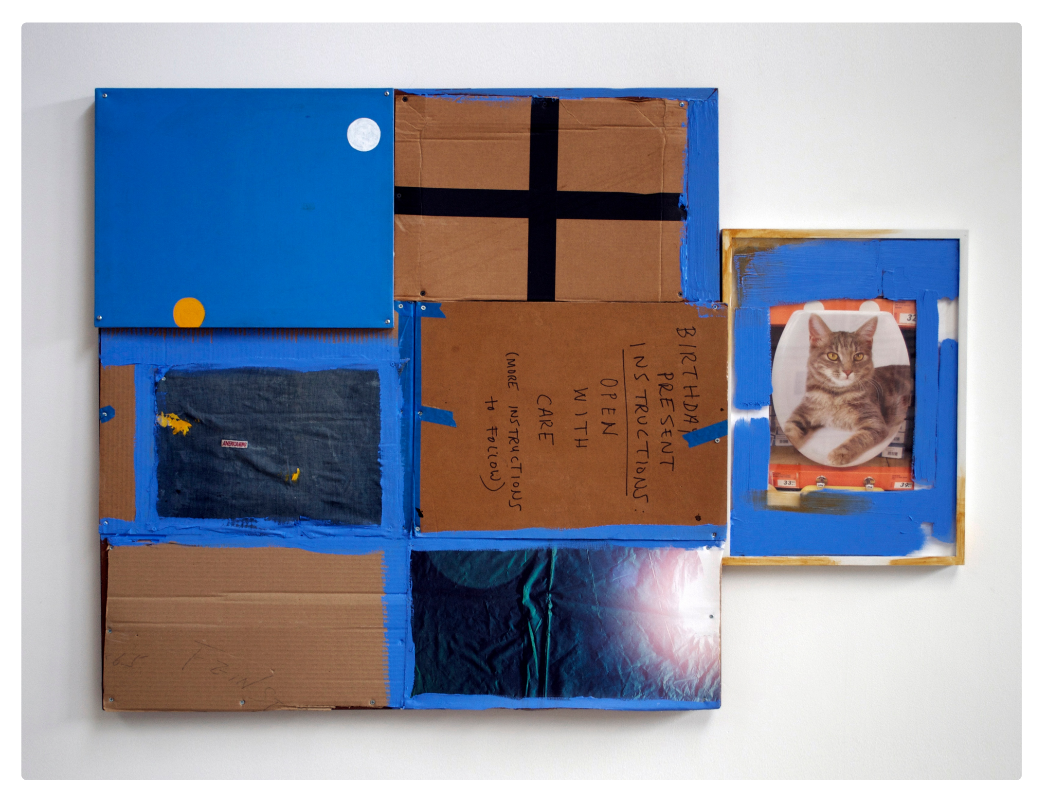
{\it Rochelle Feinstein} $$ Happy Birthday \ x \ Rachel, 2009 $$ Stretched oil painting, cloth, board, tape, acrylic, framed photograph (Rachel Harrison), 42 x 60 inches $$