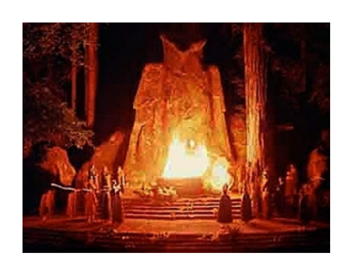
Top figure Golden Calf. 2nd figure Baal 3rd from top Asherah Bottom figure Molech Bohemian Grove America