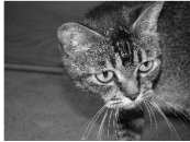
Tigress August 9