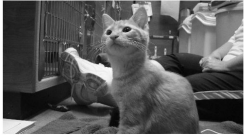
Mustard August 4