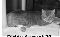
Diddy August 20