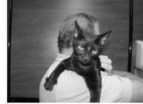
Basil August 25