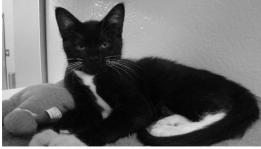
Pepper August 20