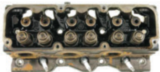
Cylinder head pre-cleanup. Note the sludge deposits on and around the valve springs and push rod openings.