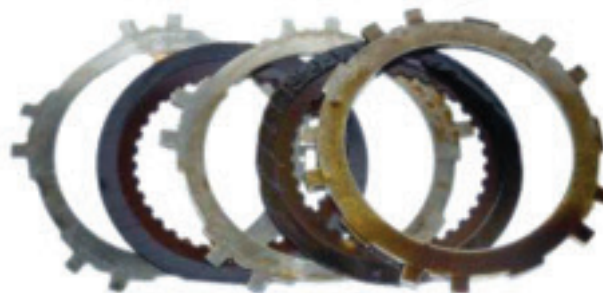
Automatic transmission clutch plates pre-cleanup. Varnish and glazing is heavy on some of the plates.

NOTE: It is not recommended to flush transmissions that do not have a removable pan or access to the transmission filter.