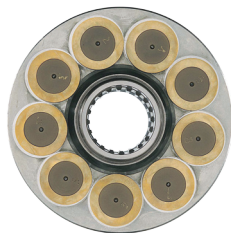
YELLOW METAL PISTON SHOES