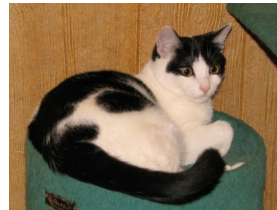
Noodles February 5

"Thousands of years ago, cats were worshipped as gods. Cats have never forgotten this." - Anonymous