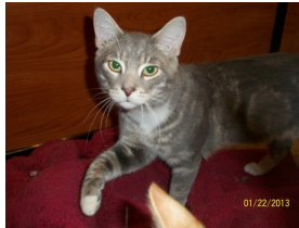
Tyler February 2