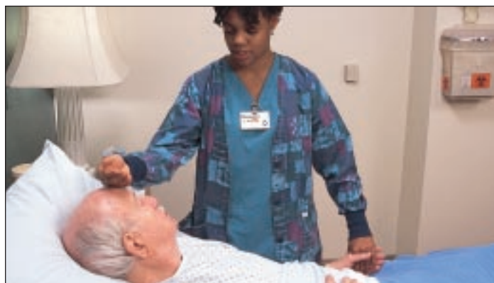
Fig. 13-7 – Paying attention to the resident will help you notice any changes that may need to be reported.

You have already learned that observation means to watch and pay attention to details. You must pay close attention to any changes in a resident and report those changes immediately. Remember, since you spend the most time with residents, you will see changes before anyone else on the caregiving team does (Fig. 13-7).