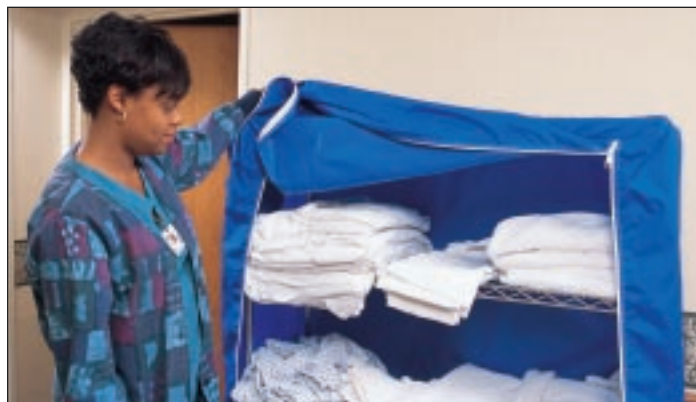
Fig. 13-8 – Gathering supplies you need to do the resident's care before you begin helps you to be organized.

All 8 of these themes are important, and you should work to incorporate them all into your everyday caregiving.