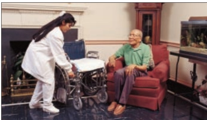
Fig. 13-5 – Locking the wheels on the wheelchair helps ensure safety.

Safety means being free from harm or risk and secure from threats or danger. The facility's environment is designed to be a safe place where the entire staff can focus on giving care in a home-like setting. But if care becomes a quick and careless routine, injuries and accidents are likely. Both residents' safety and your own depend on acting thoughtfully in every situation (Fig.13-5).