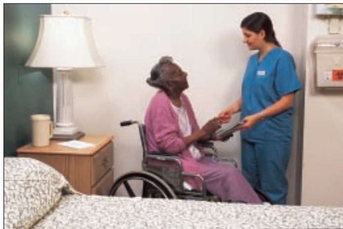
Fig. 13-9 – Completion steps include making the resident safe and comfortable.

How you complete tasks, like how you prepare for them, is similar for most of the tasks you will do daily. These completion steps let the resident know you are done with the caregiving task, help them to get safe and comfortable, and give them a chance to ask questions (Fig. 13-9).