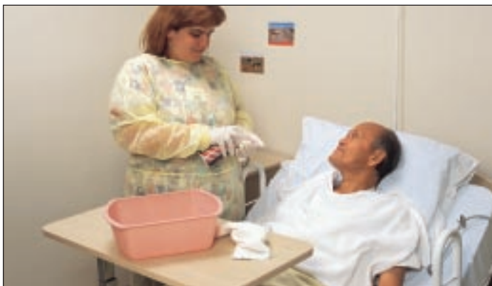
Fig. 13-6 – Using proper infection control procedures minimizes the spread of infection.

Using the infection control procedures described in Chapter 9 helps prevent the transmission of infection. The transmission of microorganisms can be kept to a minimum if everyone follows these principles (Fig. 13-6). Incorporate this theme in all your caregiving actions.