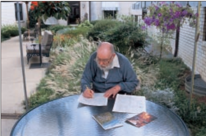
Fig. 13-2 – Residents should be encouraged to be as independent as possible.

Autonomy means making decisions for oneself, including how to live one's life. Being autonomous means being independent. You must help each resident be as independent as possible (Fig. 13-2). Encourage them to take responsibility for their care by making their own choices. Then support residents in the choices they make, even when it means you have to change how you do a task. Residents are entitled to make their own decisions about how care will be given by themselves or by you. If you become too protective or do everything for a resident instead of letting them do it, you undermine their autonomy.