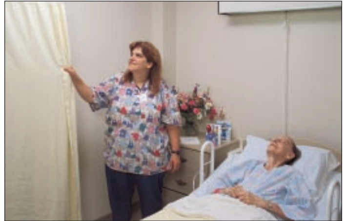
Fig. 13-3 – Maintaining the resident's privacy shows the resident you respect them.

Everyone deserves to be treated with dignity and respect. Simple courtesies show that you are respectful, such as knocking on the resident's door before entering, saying please, and asking permission. Ask yourself, "If I were this resident, how would I like to be treated?" Treating each resident with respect must be part of everything you do (Fig. 13-3). Remember that all residents are human beings and have their own feelings, thoughts, and beliefs. You must respect and never violate their basic human rights.