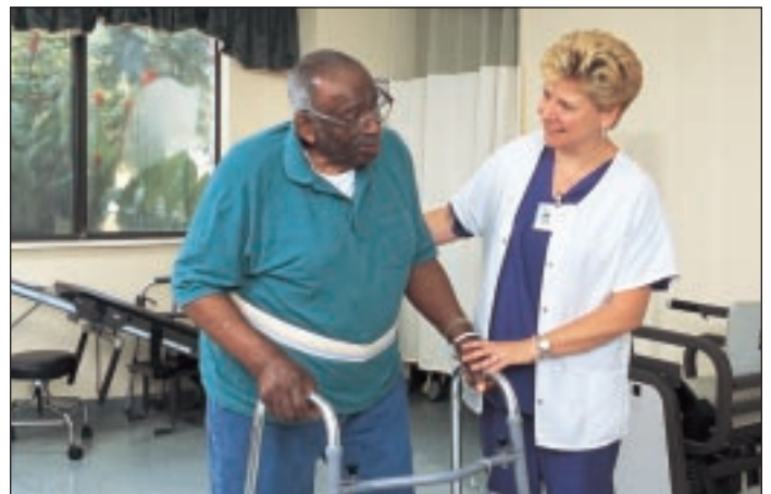
Fig. 13-4 – Always work with the residents to help them achieve their goals.

Maximizing capabilities means that you work with the resident's capabilities and support them to their fullest. You emphasize what the resident can still do—not what they cannot do. When you incorporate this theme into your care, you become a coach. You work with the resident to help them be the best they can be (Fig. 13-4). Check the care plan for information about what a resident can do.