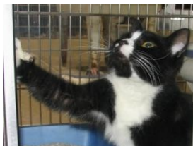
Valery March 14