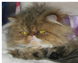
Mittens March 1