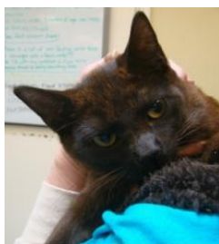
Black Bear March 16