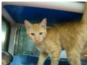
Honey Bear March 2