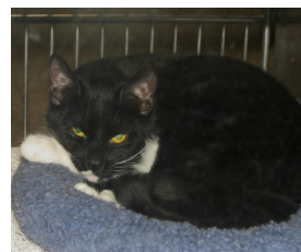
Baby March 19