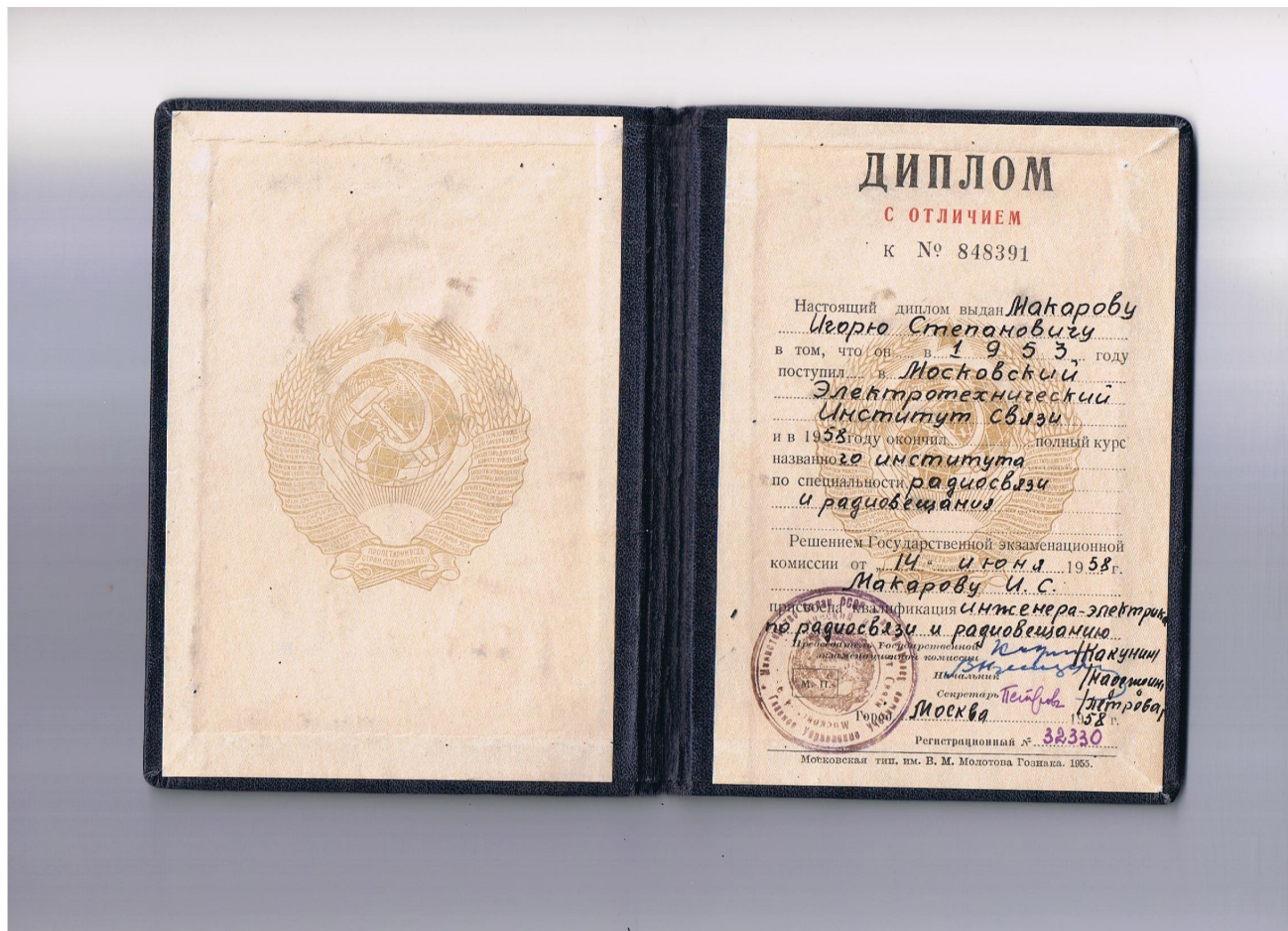
My graduate diploma