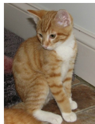
Zain December 28