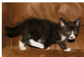
Alastair December 21