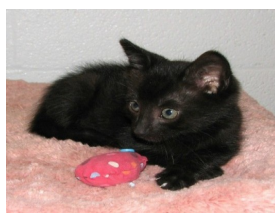
Harland December 12