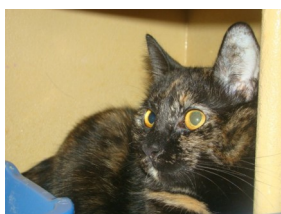
Jewels December 7