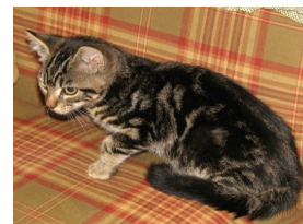
Alfie December 31