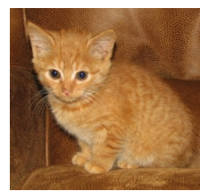
Kelda December 20