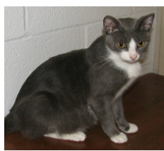
Jaana December 12