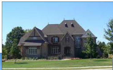
Wingate University—Administration Building

Monroe is the county seat of Union County where you'll find quaint downtown shops as well as hiking and horse trails. In fact, Union County is home to the largest equestrian population in the entire state!