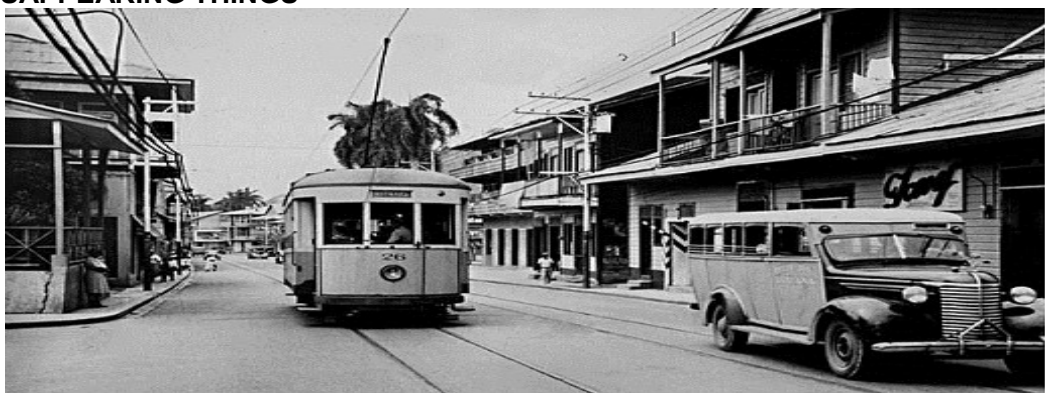
Board buildings, Tram car & chiva