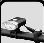
BT30R and remote switch