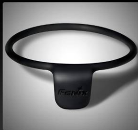
Large for 30mm-35mm