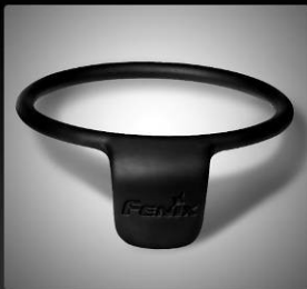
Medium for 24mm-30mm