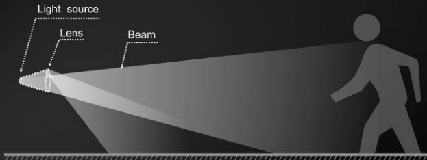
Fenix Bike Light

The upward beam of the Fenix bike light is refracted to the ground rather than shine into the eyes of pedestrians.