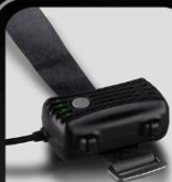
BA2B Battery Pack