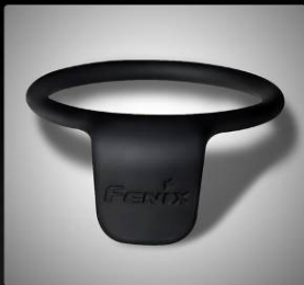
Small for 20mm-24mm

Compatible with various kinds of handlebars.