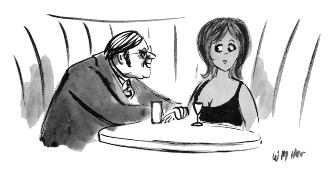
"How's about you and me flying out to Utah and taking a gander at some of the earthworks I've financed?"