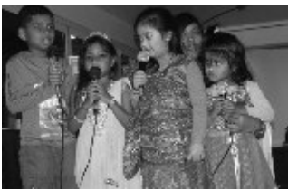
Spiritual Darlings' tribute