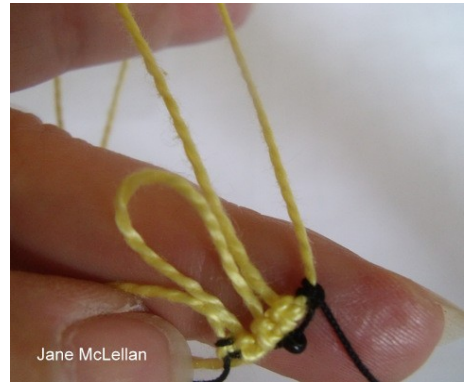
Shuttle 1: long picot, 3 ds. Alternate shuttles in this way until there are 6 'petals'. Inner Ring

Do one black stitch as before. Then drop yellow thread, and reverse work. Using shuttle 2, put 6 beads on the back of the hand. Make a ring: 1 ds, then slide a bead from the core thread and from the shuttle thread, 1 ds. Repeat until there are 3 sets of beads. Then make a small picot, adding a bead from the shuttle thread below it. Continue with the ring, adding beads as before until all the beads from the core thread are used up. (Note, see Jane Eborall's Winsome Drop earrings for this method). Close ring.