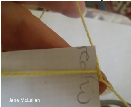
Shuttle 2: Put shuttle thread over hand and around pinky. Slide one bead close to work and then work 2 stitches in black, unflipped.