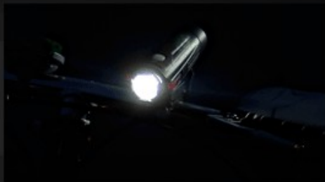
Flashing red when main light flashes *The Flash mode will flash at 380 lumens and 100 lumens alternately.