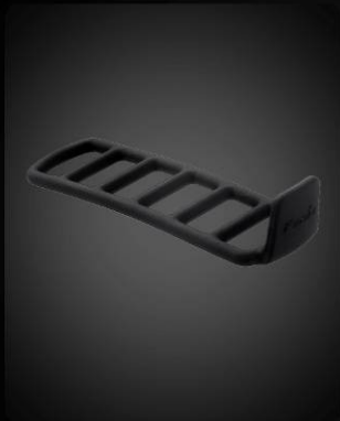
Ladder-type mounting strap with different hole sizes

* Applicable in bike handlebars with diameter between 20mm-35mm