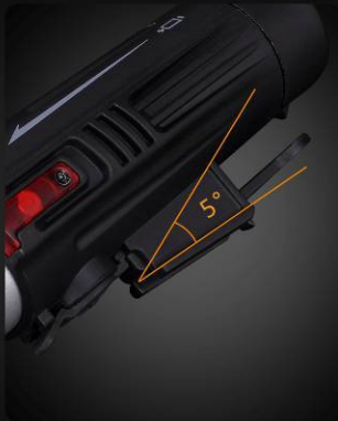
Light body comes with tilt of 5 degrees downward

* Applicable in bike handlebars with diameter between 20mm-35mm