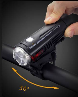
Light angle can be modulated left and right to 30 degrees