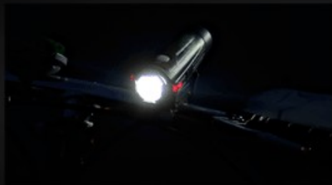
Being constant-on as the main light on

BC21R is equipped with side red light lit on in accordance with the main light, increasing visibility and ensuring the riding safety.