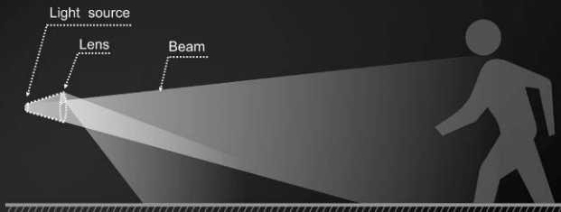
Fenix Bike Light

The upward beam of the Fenix bike light is refracted to the ground rather than shine into the eyes of pedestrians.