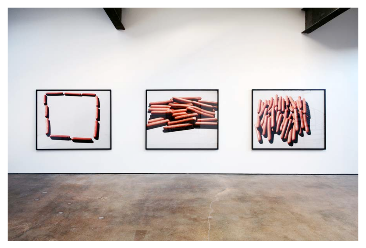
Installation view of Lucas Blalock: Late Work November 8 – December 20, 2014