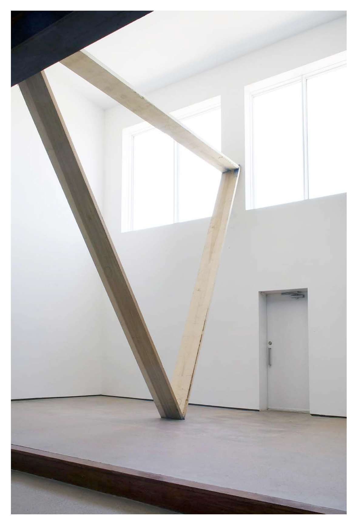
Installation view of Impossible Vacation with artwork by Virginia Overton May 7-June~4,~2011