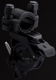
Bike mount ALB-10