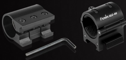
Rail mount ALG-01/ALG-00