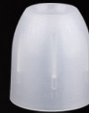
Diffuser tip AOD-M