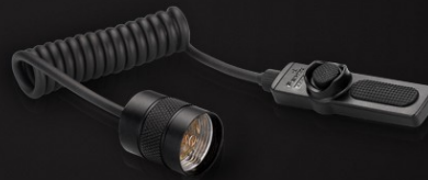
Remote switch AER-03*