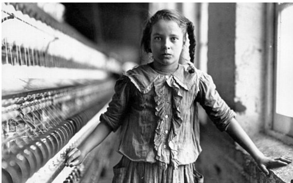
Pauper apprentice: Children were often sold to masters as it meant their parents had one fewer month to feed.

Children in glassworks were regularly burned and blinded by the intense heat, while the poisonous clay dust in potteries caused them to vomit and faint.