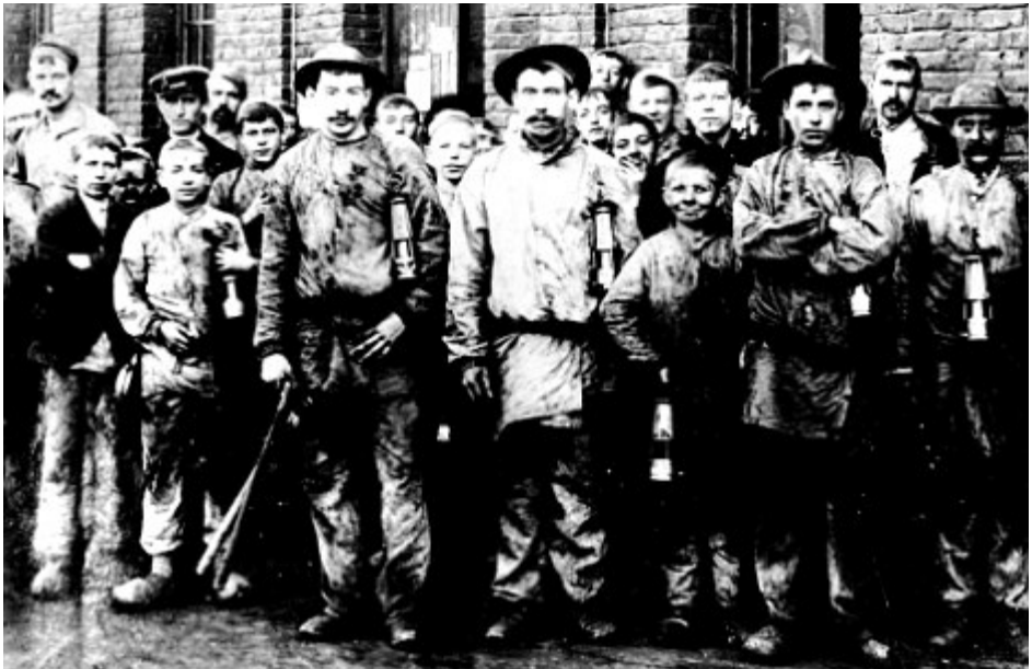
No idea: Few people had any concept that children, like those pictured here, were being used to excavate coal. The findings of a report in 1842, shocked many.

Even when regulations were eventually passed to improve working conditions, with only four inspectors to police the thousands of factories across the country they were seldom enforced.