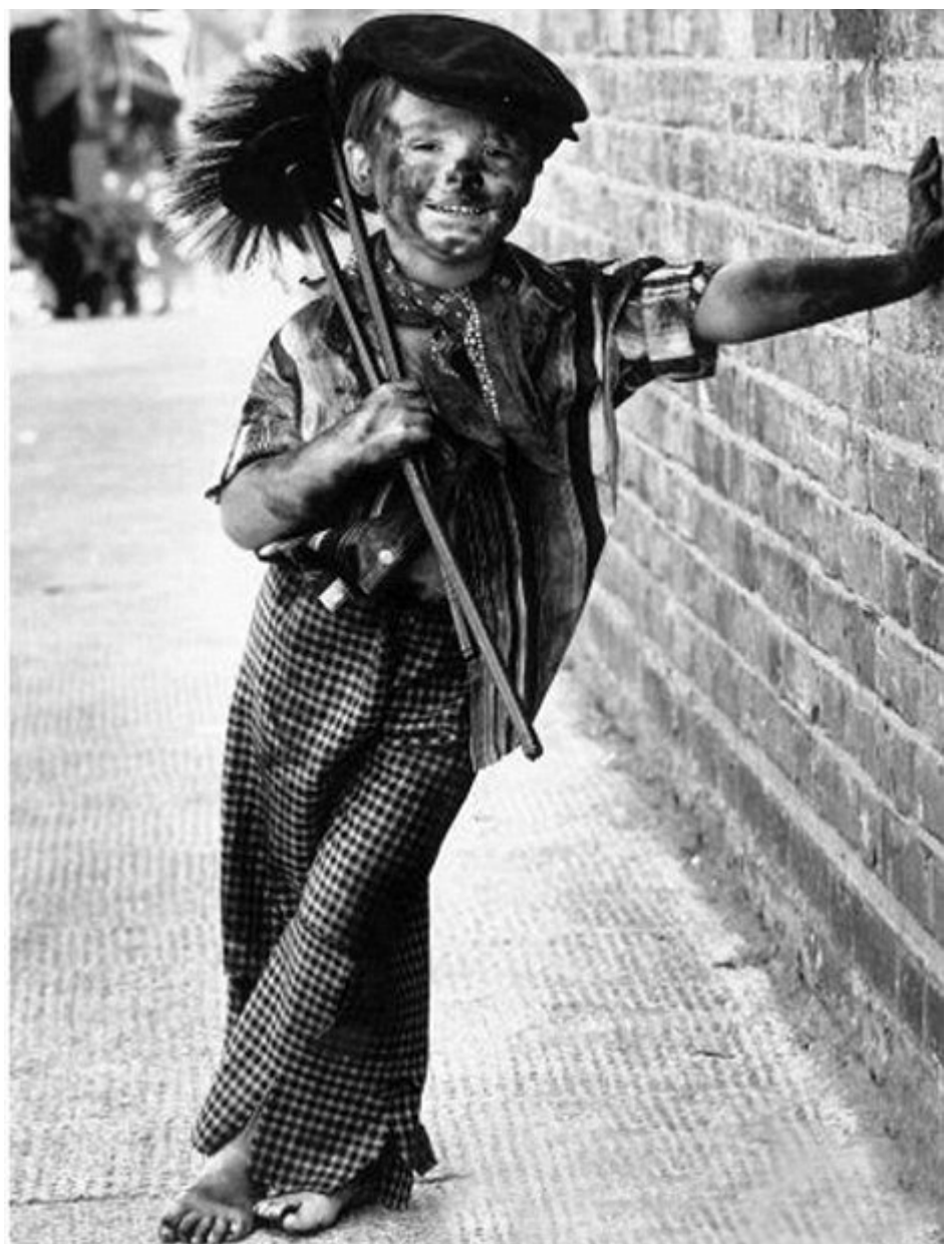
Grubby work: Child chimney sweeps often had to crawl through holes only 18in wide and cruel masters would light fires to make them climb faster. Many fell to their deaths.

Dangerous: Child chimney sweeps often had to crawl through holes only 18in wide - and cruel masters would light fires to make them climb faster. Many fell to their deaths