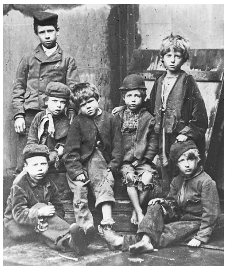
Impoverished: Children who worked were subject to appalling conditions. Many who worked died before they reached 25.

Impoverished: Children who worked were subject to appalling conditions. Many who worked died before they reached 25