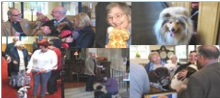
A few pictures from the Pet Service

Thank you for reading the Sammy Rambles Writing Tips. Copies of the previous writing tips are available on the website - www.sammyrambles.com .