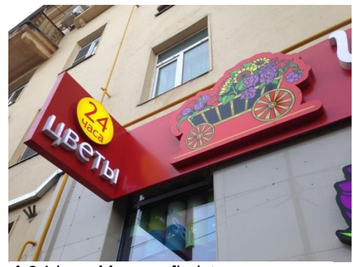
A 24-hour Moscow florist

Maria thinks that retail and food and beverage outlets are reducing their hours while museum, galleries and libraries are still extending theirs and they are meeting somewhere in the middle around 10pm or 11pm! My guess is that the two sectors' trading hours are pulled in different directions by the same force – increased wealth. As people earn more they need to work less, they have more disposable income so they can go out more.