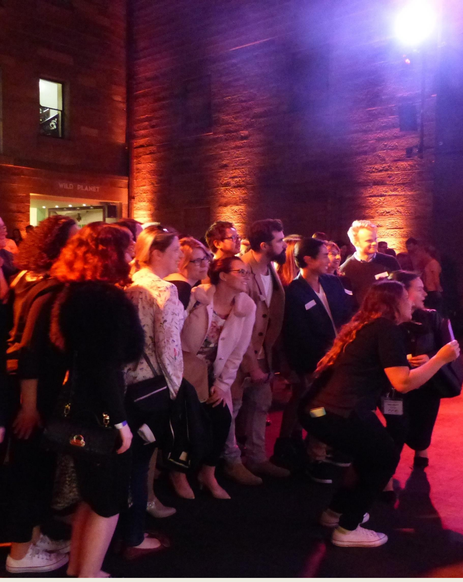
The winners show off their prize at the Murder Mystery event at the Australian Museum, September 2017