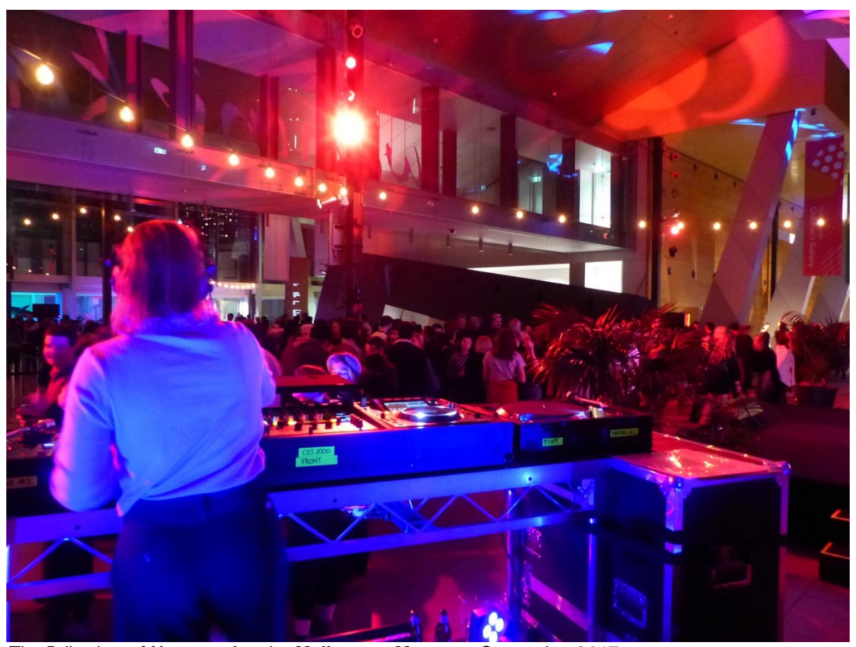
The DJ's view of Nocturnal at the Melbourne Museum, September 2017