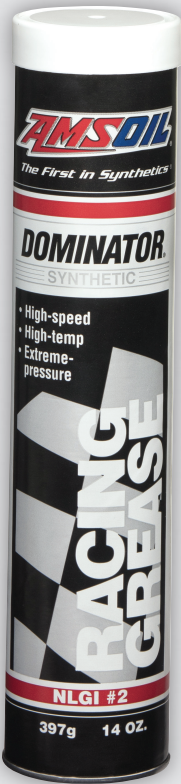
NLGI #2 GC-LB

DOMINATOR Racing Grease contains a robust package of oxidation inhibitors, helping prevent grease breakdown and component surface damage. Its excellent adhesion and cohesion properties allow it to resist water washout during operation in wet conditions. A premium blend of corrosion inhibitors further protects against corrosion formation.