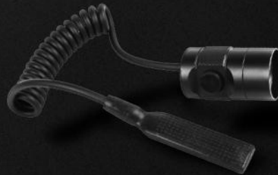
Remote switch AER-01/02