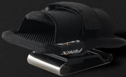
Belt clip AB02