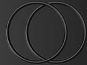
2* Spare O-rings