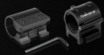
Tactical flashlight clip (ALG-01/ALG-00)