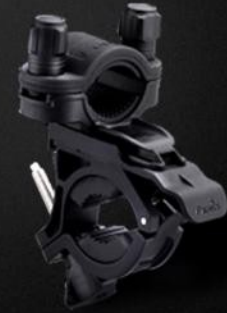
Bike mount ALB-10