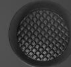
Spare rubber switch boot