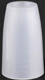
Diffuser tip AOD-S