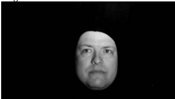
After video filters

I tested the projection out by playing the DVD through the projector onto a foam wig head. It was easy to tell that the foam wig head was not going to work as the projection looked too small. Using pink 2" foam sheets cut into 16" squares I glued them together into a large block. I had an artist friend of mine use a foam cutter to carve out a faceless oversized wig head. I painted it white and placed it on a pedestal that I created using a simple wooded frame covered in 1" white foam and painted. When the video was projected on the head it worked pretty well. The face still had a sort of round look to it but for the first year we went with it.