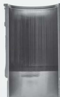
Severely Scuffed Liner