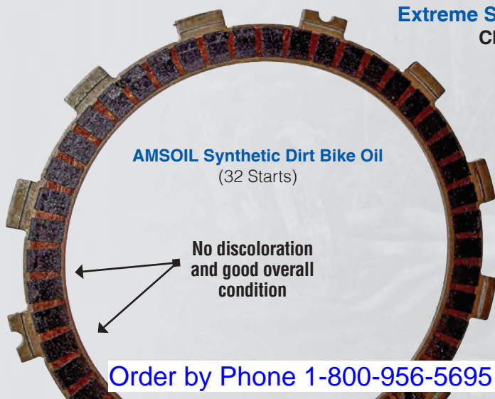
AMSOIL Synthetic Dirt Bike Oil (32 Starts)

No discoloration and good overall condition