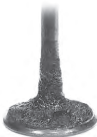
Intake Valve before P.i. Treatment