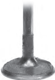
Intake Valve after P.i. Treatment