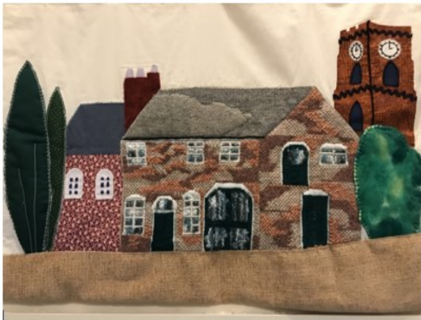
St Mary's Coach House Rectory Road Oldswinford DY8 2HA

In promotion of The Coach House you are invited to an afternoon of Cream Teas on Saturday 22 nd June between 2.00 - 4.00 pm. Do come along, enjoy the hospitality and see for yourself how this facility serves the community – and could serve you.