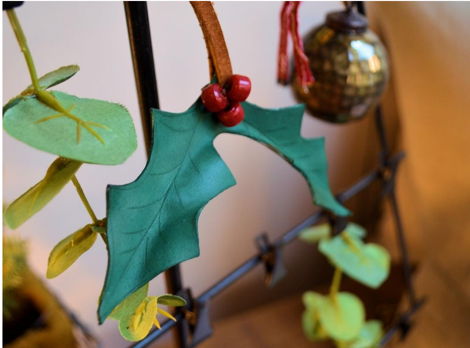
Christmas Holly – Leather Decoration

for people who make, mend or adapt things out of leather