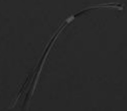
4 x Nylon cable ties

Package size: 7.09" x 3.82" x 1.34" / 180 x 97 x 34 mm