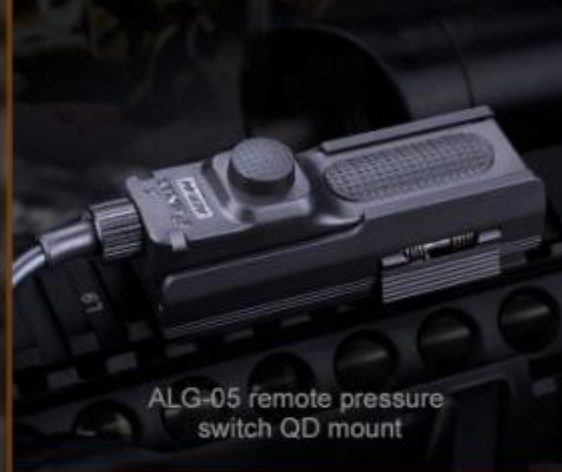
ALG-05 remote pressure switch QD mount