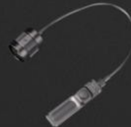
AER-04 remote pressure switch