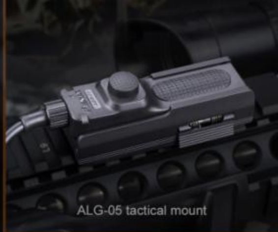
ALG-05 tactical mount