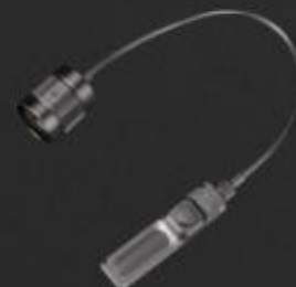
AER-05 remote pressure switch