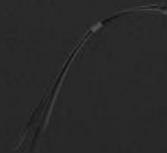
4 x Nylon cable ties

Package size: 7.09" x 3.82" x 1.34" / 180 x 97 x 34 mm