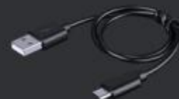
USB Type-C charging cable