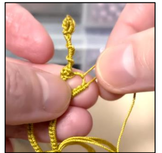
Turn the motif (like turning the page of a book) and then repeat the process to make the corresponding branch, link, candle, and flame on the opposite side.