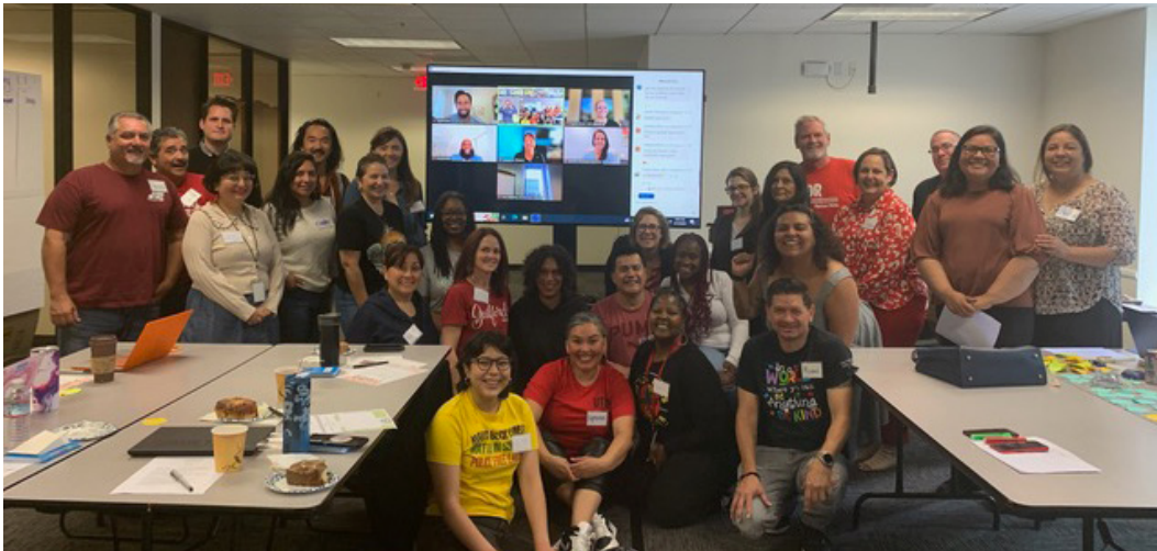
LA Steering Committee meeting.

In this report we look at how community schools are structured to bring students, teachers, parents, guardians and administrators together to co-govern schools to support students and families. This report examines in particular the inspiring community school models launched in the Los Angeles Unified and San Diego Unified school districts in recent years.