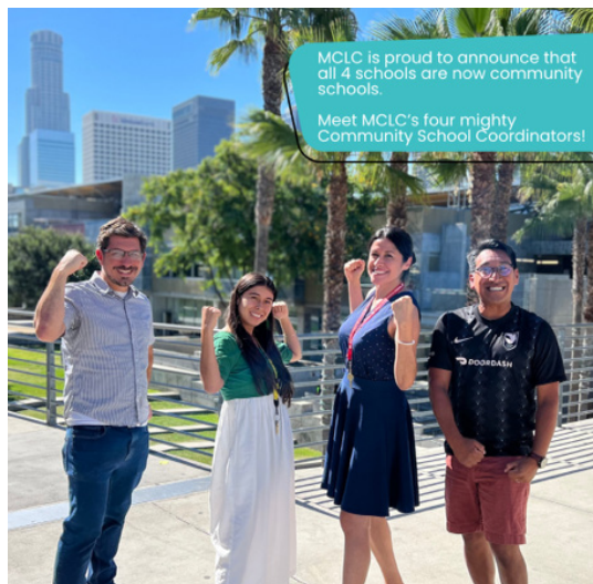
Community School Coordinators at the Miguel Contreras Learning Complex in Los Angeles.

principal, teachers and staff to ensure the school is implementing all six key practices, including collaborative decision-making.