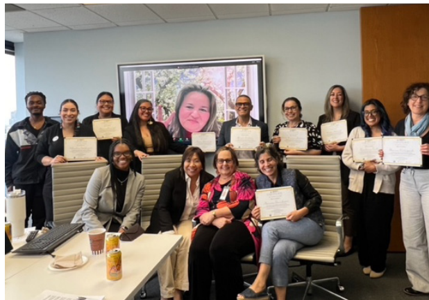
LAUSD meeting with Community Schools Coordinators.

The collaboration between the district and the union is ongoing and is centered around the steering committee. The committee is the space in which stakeholders can collaborate around resourcing, the application process, grant writing, ongoing learning and improvement, advocacy and decision-making. Governance by committee does not come