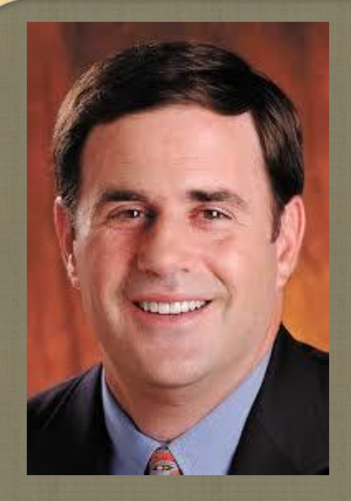
Governor - Doug Ducey