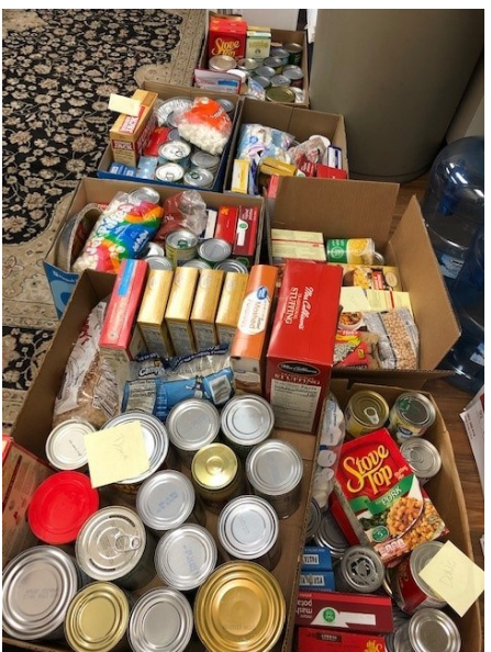
Stockings, blankets and Food Boxes that the Women's Club and Greenlee County Loins Club Donated to the Elf Project.