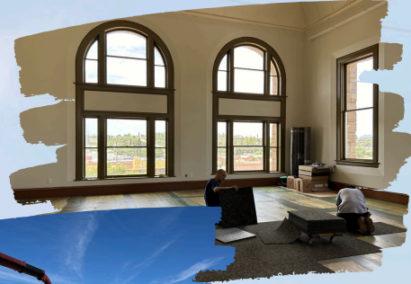
Courthouse Rehabilitation Project, Santa Cruz County