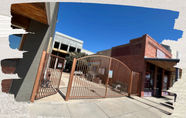
Willcox Heritage Theater & Arts Center Project, Willcox