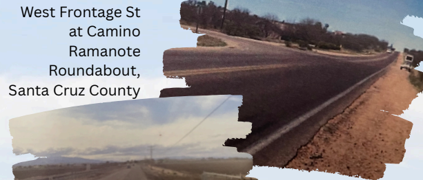
West Frontage St at Camino Ramanote Roundabout, Santa Cruz County