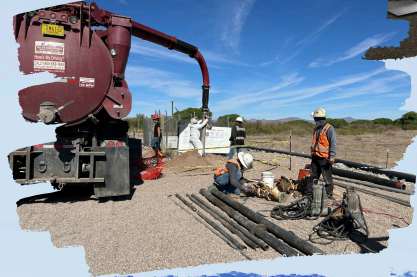
Lion’s Park Improvements Project, Benson