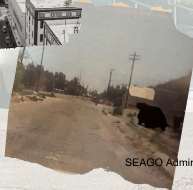
High Street Improvements, Duncan