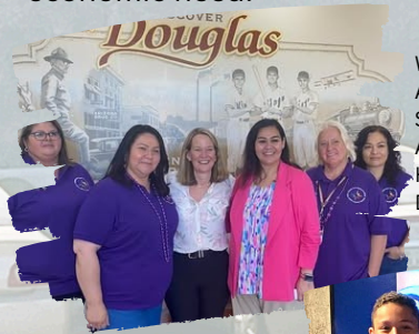
World Elder Abuse Awareness Day SEAGO staff with AZ Attorney General Kris Mayes, Douglas