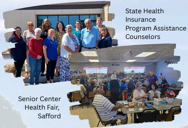
State Health Insurance Program Assistance Counselors