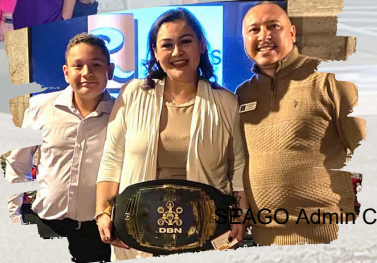
SEAGO Admin Council Mtg 2/6/26