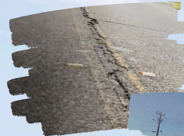
Peridot Road Pavement Overlay, San Carlos Apache Tribe, AZ