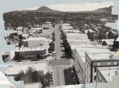
Downtown Revitalization Streetscape Project, Douglas