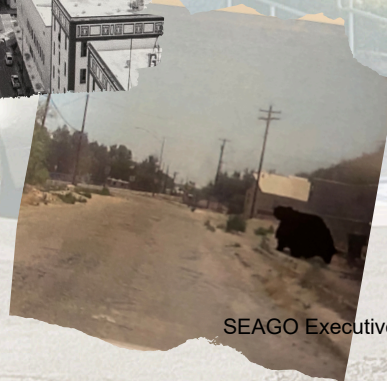
SEAGO Executive Board Meeting 2-20-2026