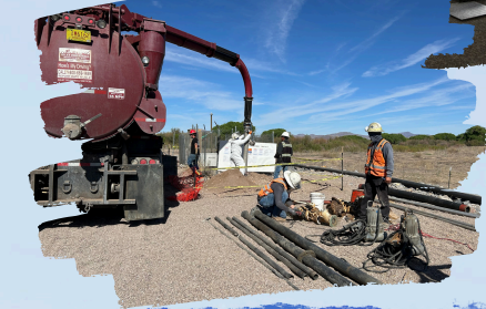
Courthouse Rehabilitation Project, Santa Cruz County