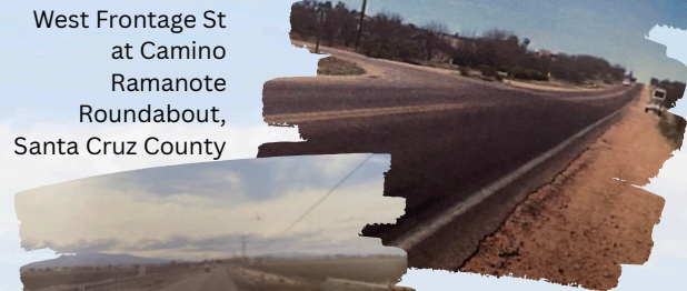
West Frontage St at Camino Ramanote Roundabout, Santa Cruz County