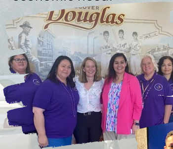
World Elder Abuse Awareness Day SEAGO staff with AZ Attorney General Kris Mayes, Douglas