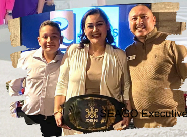
SEAGO Executive Board Mtg 2-20-2026