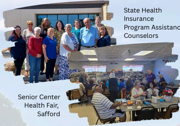
Senior Center Health Fair, Safford