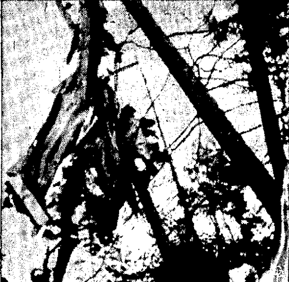
Wreckage of a Swedish military reconnaissance plane is shown on the ground near Vaggryd, Sweden, after it had collided head on with one of the mysterious rockets which have been reported seen in that area. Three fliers were instantly killed in the crash.