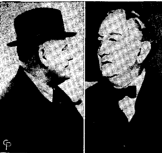
United States Senator Tom Connally, right, and W. J. Jordan, left, of New Zealand both voiced their sentiments on Russia's tactics in the Paris peace conference. Connally, as he boarded the Queen Mary to sail to France, told reporters that Russia 'has maintained an unreasonable position and "we cannot settle international difficulties like a bunch of fussy schoolboys." At the same time, Jordan, after listening for 50 minutes to a Russian delegate expound on the exclusion of France from voting rights, exclaimed "It's quack, quack, hour after hour, and I'm sick of the blasted old rot."/>