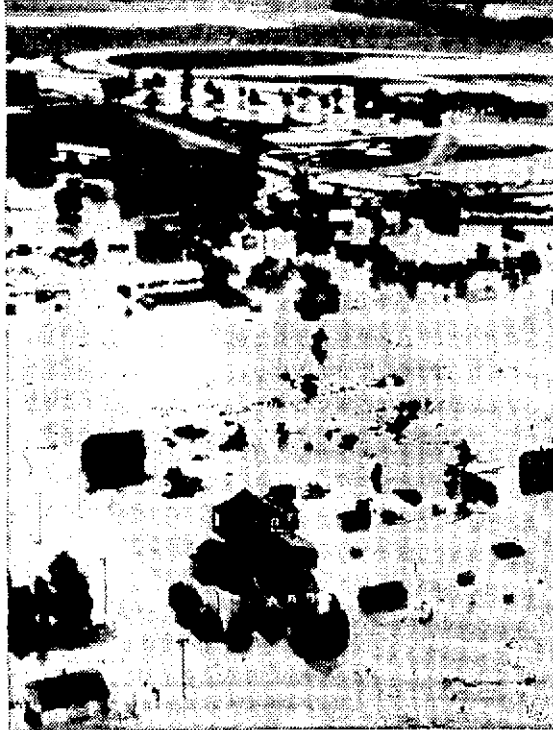
Record rains sent a flash scurrying over a section of the highway between East St. Louis, Ill., and Collinsville, inundating farms and buildings. More than 2,000 families in the St. Louis area were left homeless and two persons were reported drowned. August rainfall was so heavy it broke a 109-year record.