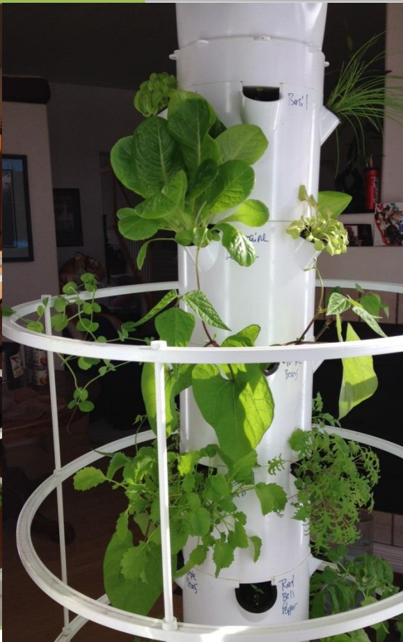
4 Weeks from Seed