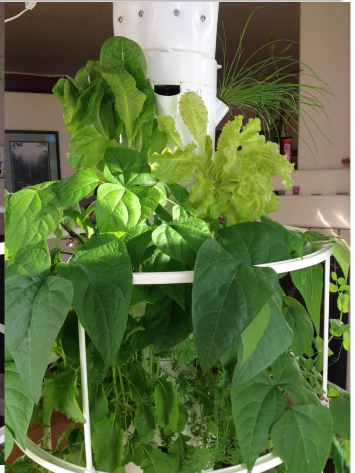
6 Weeks from Seed