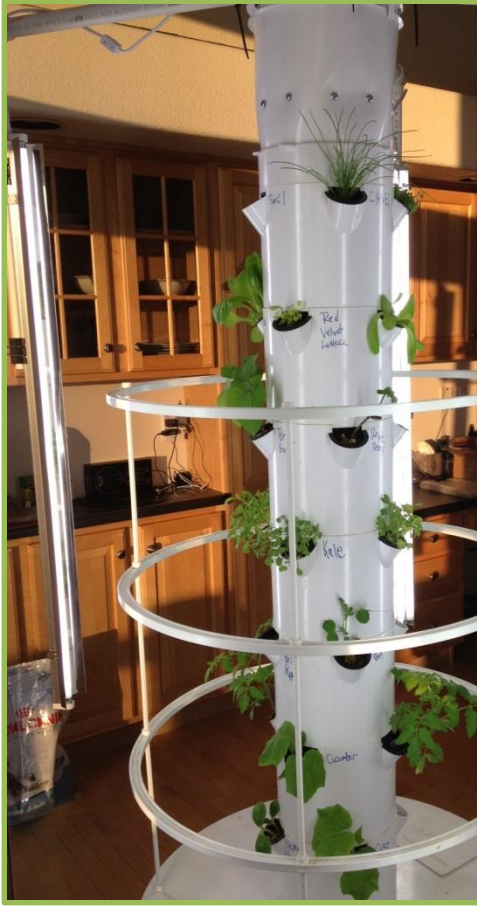
2 Weeks from Seed