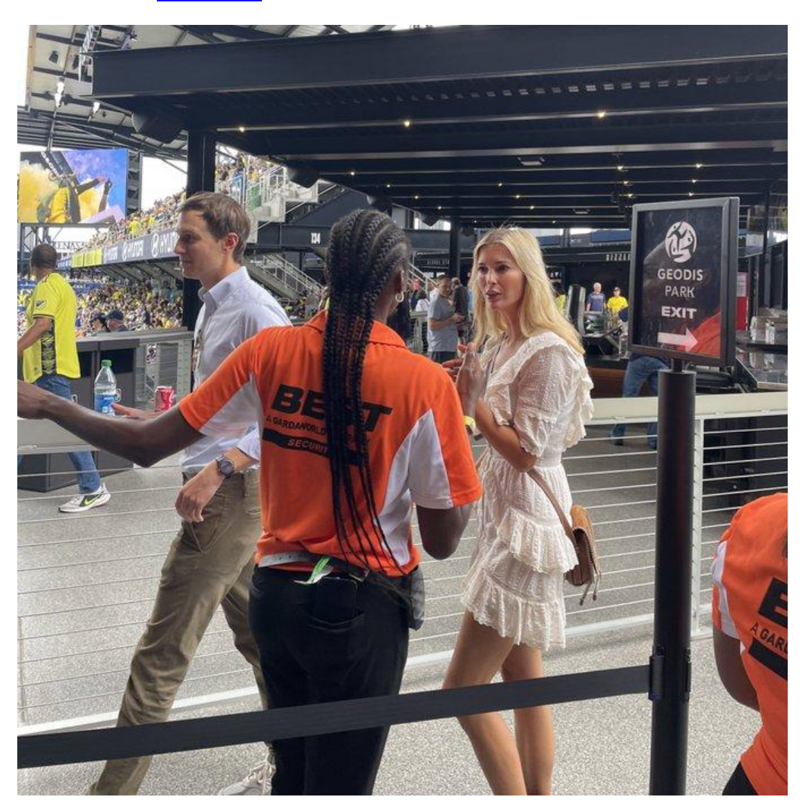
3:35 PM · Sep 10, 2022 · Twitter for iPhone

in attendance at <u>#NashvilleSC</u> match