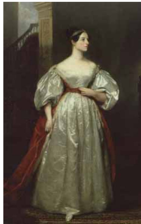
Ada Augusta, Countess of Lovelace

being u_z = a + bx + cx^2 + dx^3 + ex^4 + fx^5 + gx^6 ,