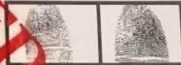
LEFT THUMB PRINT RIGHT THUMB PRINT

WANTED FOR: ESCAPE Warrant Issued: WESTERN DISTRICT OF TEXAS Warrant Number: 9180-1114-0164-A DATE WARRANT ISSUED: November 10, 1990